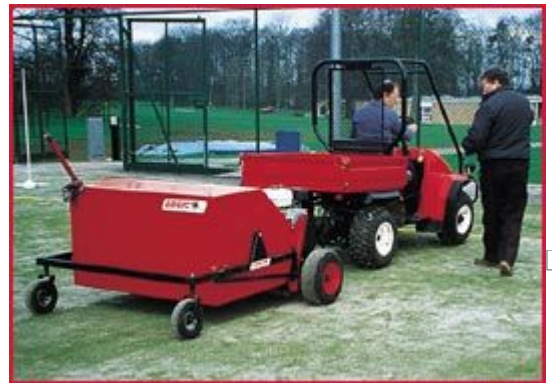
MSC120 Working on AstroTurf