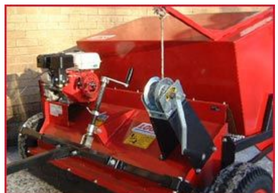
MSC120 Showing Winch and Height Adjustment