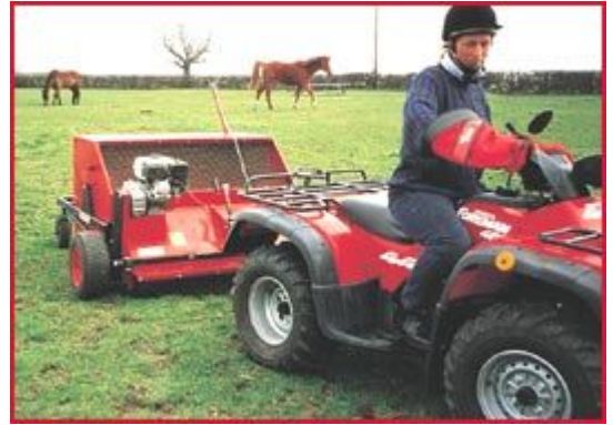
MSC120 Horse Muck Collector